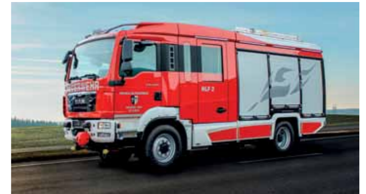
HLF 2, Pumper