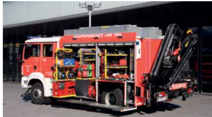
Heavy duty rescue vehicle with crane