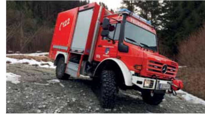
Transport vehicle with crane