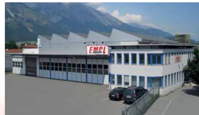
Service plant, Hall in Tirol