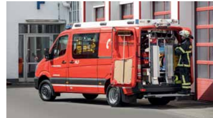
HLF 1, Rapid intervention vehicle