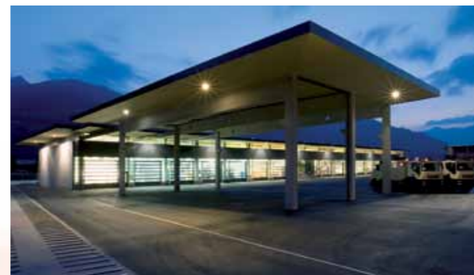
EMPL Technologie Schmiede, Industrial park in Uderns