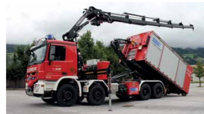
Load handling system with crane and HAZMAT container