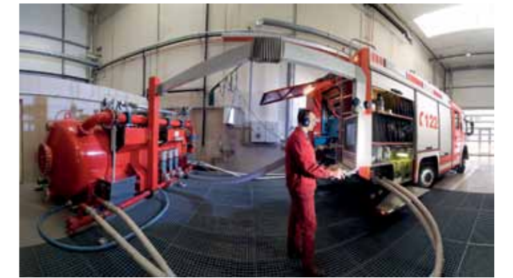
High-Tech test facilities