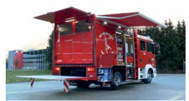
Water rescue vehicle