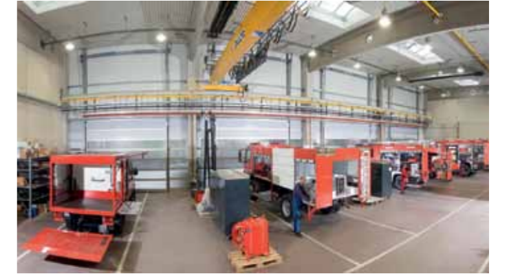
The Very Latest Production Systems

Continuous investment in modernising the plants are one of the recipes for success.