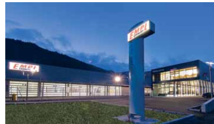
EMPL Service Park with Fire fighting shop, Kaltenbach