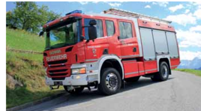
TLF 3.000/200, Pumper