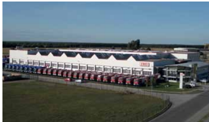
Headoffice Germany, Zahna Elster

Quality controls in all stages during and after the production characterise the EMPL organisation according to ISO 9001, ISO 14001 and ISO 3834-2. The quality responsibility of each individual employee guarantees highest customer satisfaction!