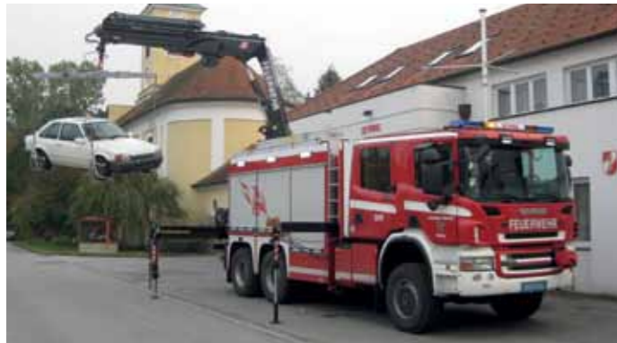
Heavy duty rescue vehicle with crane