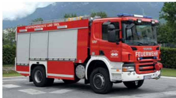
Heavy duty rescue vehicle