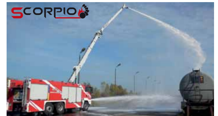
ULF 2000/1000/1000/500, Pumper for industrial application