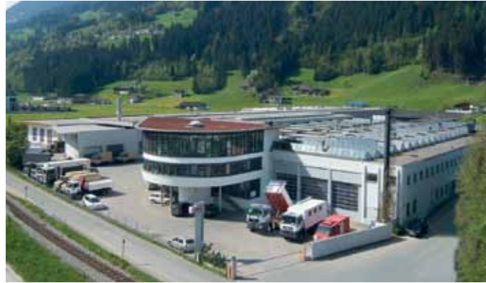
Headoffice Austria, Kaltenbach

EMPL has evolved from a 3-men black smith into a leading manufacturer of truck superstructures and special trailers in the areas of "Fire fighting vehicles", "Commercial vehicles" and "Logistic products".