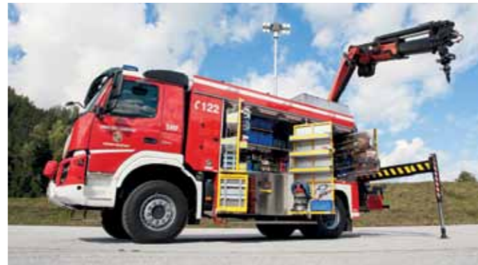
Heavy duty rescue vehicle with crane