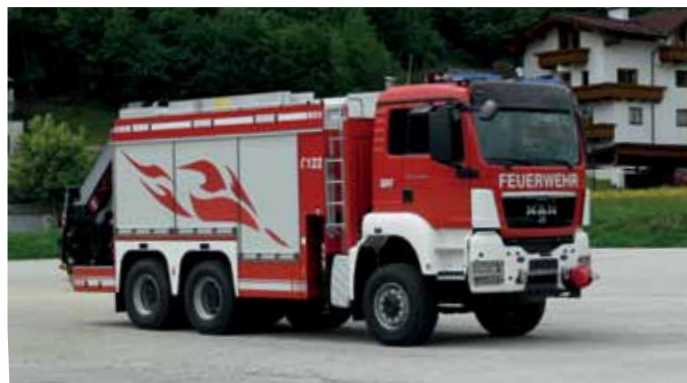
Heavy duty rescue vehicle with crane