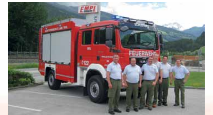
Taking over of a new fire fighting vehicle