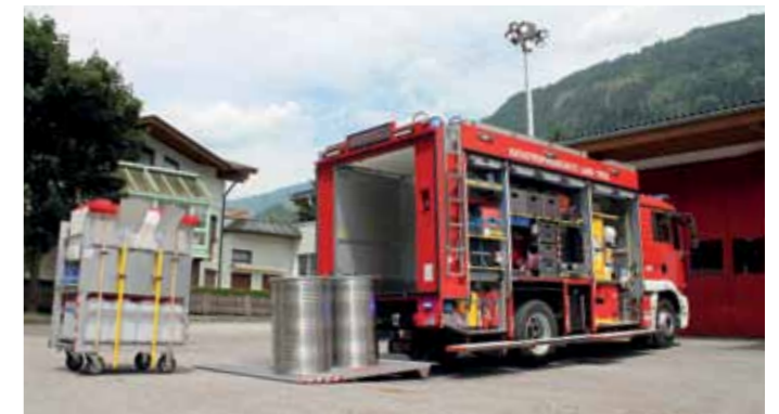
HAZMAT, Hazardous material vehicle